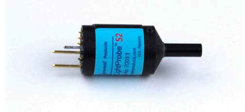
Part Number: ULP-S2 SCC

Universal LightProbe S2 Unicolor Digital Sensors are designed for the simple ON / OFF test and color check of a single color LED, with a one-bit digital output, quickly determining PASS/FAIL status without further processing by the ATE.